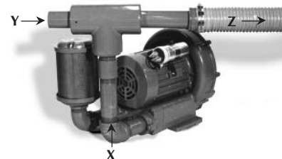
(X) Motive air; (Y) Product pick-up with vacuum flow; (Z) Air exhaust from "X" and material from "Y"

Aspirator are ideal for applications such as transporting lightweight materials such as paper trim, textile trim, film, dust, etc.