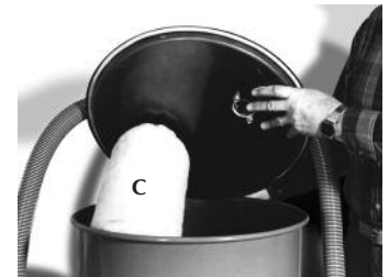
(A) Vacuum flow from receiver to blower; (B) Vacuum flow to receiver; (C) Filter