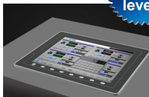
Dimming Condition (Dark)