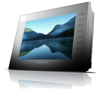
MONITOUCH V9 Series