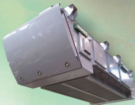
Main power converter