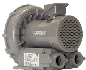
Ring Compressors /Regenerative Blowers